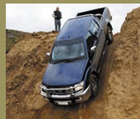
Navara shows off its impressive low-range gearing on climbs (this pic) and descents (above)